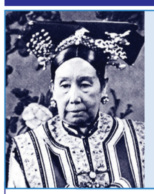
▲ The Dowager Empress Cixi (1862–1908)